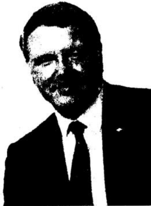
JAMES "BO" GRITZ

The Time is Now—Let's Take America Back From the "Republicrats" Who Have Brought Our Nation to the Brink of Ruin